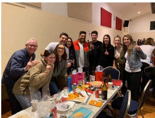
Trivia Night Winners!