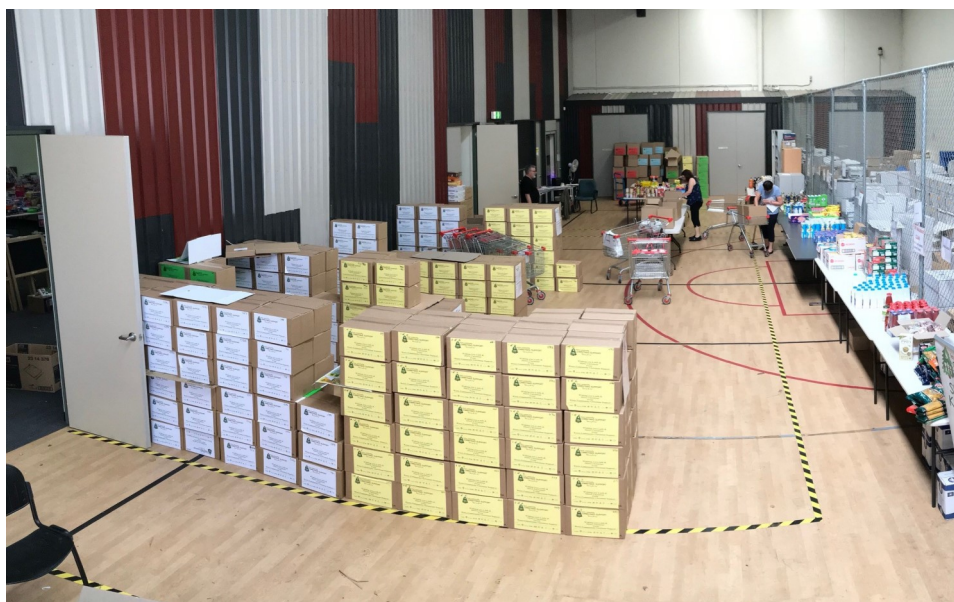
Volunteers preparing hampers for those in need at Christmas

Thank you to all of the 2019 volunteers for your commitment and support of the Knox “Sharing the Joy” Appeal. Your gift of time enables this very worthwhile community project to continue to support individuals and families living in Knox.